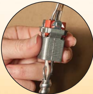
Push on cable