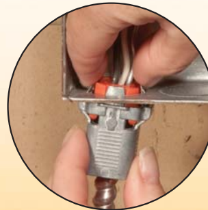
Squeeze - pull out of box